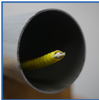
An armored 12 strand fiber optic cable.