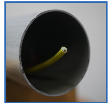
An armored 12 strand micro-armored fiber optic cable.

By utilizing armored vs innerduct/cabling you can provide significant increase in open space of core holes/ conduits, reducing the cost and impact for future capacity of building pathways.