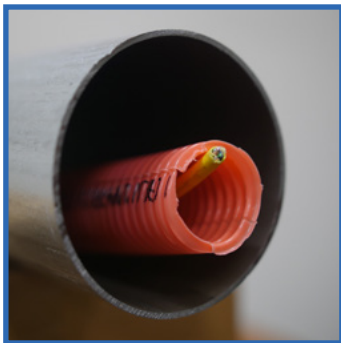
A 12 strand fiber optic cable inside innerduct (typically 1.25").

Below is a set of pictures showcasing a standard 4" conduit and the amount of space that fills up using armored vs. innerduct cabling.